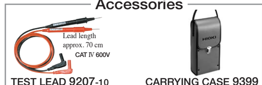
TEST LEAD 9207-10