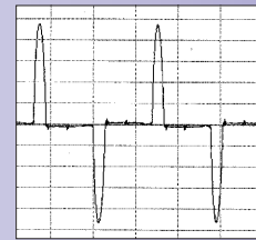
Current waveform of the inverter (primary side)